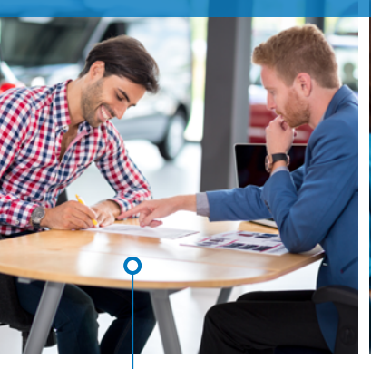
Powerful enough to kill 99.9% of viruses and bacteria.