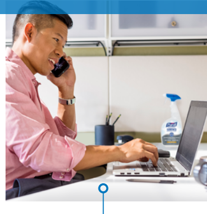
Compatible with most surfaces – from desks to electronic screens.