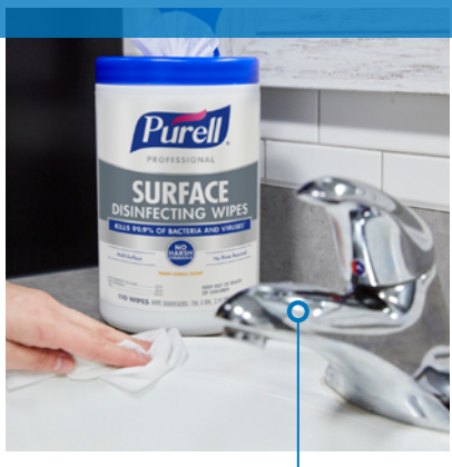
No harsh chemicals. No harsh odors. No precautionary statements.